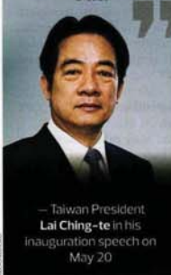
— Taiwan President Lai Ching-te in his inauguration speech on May 20

“ I want to urge China to stop intimidating Taiwan politically and militarily, and to take on the global responsibility with Taiwan to work hard on maintaining peace and stability across the Taiwan Strait and in the region, to ensure the world is without the fear of war breaking out. ”