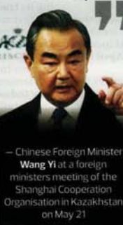
— Chinese Foreign Minister Wang Yi at a foreign ministers meeting of the Shanghai Cooperation Organisation in Kazakhstan on May 21

“ The ugly acts of Lai Ching-te and others who betray the nation and their ancestors is disgraceful. All Taiwan independence separatists will be nailed to the pillar of shame in history. ”