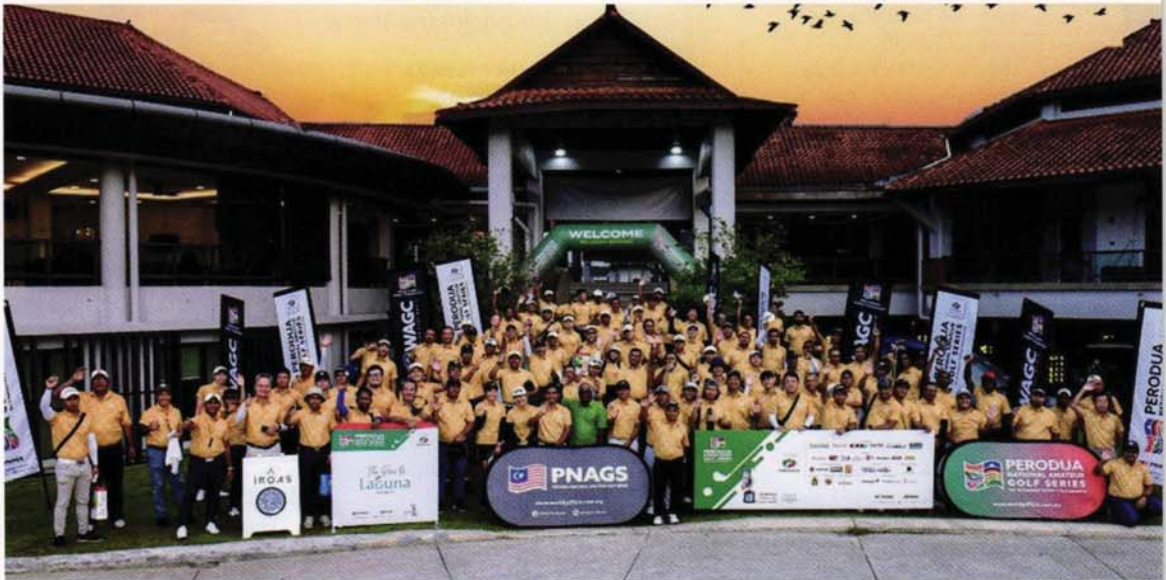
Selangor's enthusiastic participants at Kelab Golf Seri Selangor.