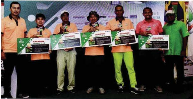
Winners of the Wilayah Persekutuan leg, played at The Mines Resort & Golf Club.