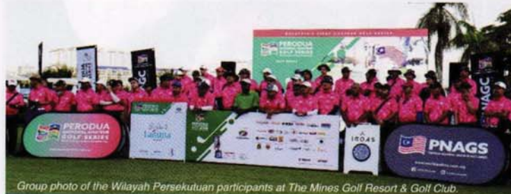
Group photo of the Wilayah Persekutuan participants at The Mines Golf Resort & Golf Club.