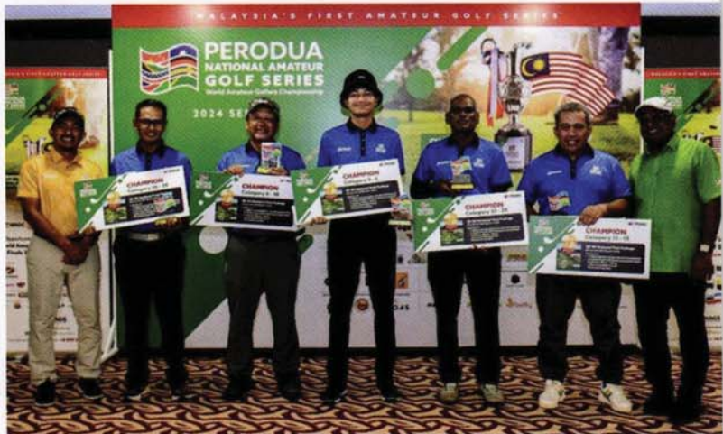
Winners of the Selangor leg, played at Kelab Golf Seri Selangor.

The Perodua National Amateur Golf Series (PNAGS) 2024 commenced in late February and will comprise 14 qualifiers spread over 14 states.