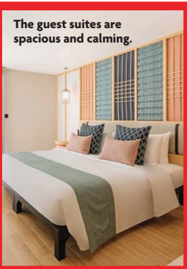
The guest suites are spacious and calming.