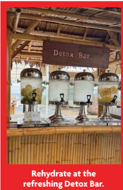
Rehydrate at the refreshing Detox Bar.

The Kids Club offers several programmes for children from four months to 17 years, with exciting age-appropriate activities and friendly staff. Next year, the new Family Oasis will also open – a dedicated zone complete with comfortable rooms, a water-play zone and a snack bar, to make lasting memories that transcend generations. In holiday mode and enjoying the thrill of not having to adhere to a schedule, I wandered around the sprawling 40-acre estate, ticking off anything that tickled my fancy, including the exhilarating flying trapeze, a cooking class and a round of golf, before rejuvenation came calling. An icy cucumber-spiked water from the Detox Bar in hand, I floated along the paths weaving through the lush gardens, past Club Med Spa – lauded for its traditional Thai massages