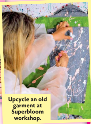
Upcycle an old garment at Superbloom workshop.