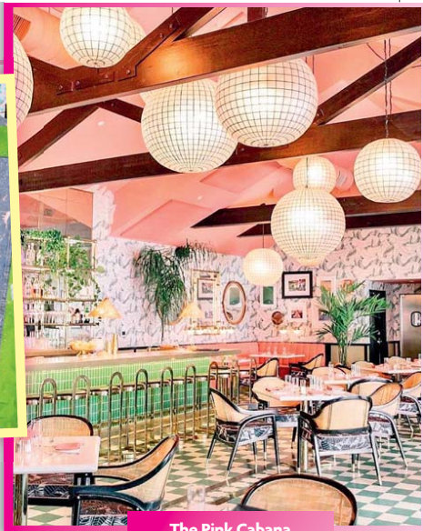
The Pink Cabana restaurant is perfect for dinner and drinks.