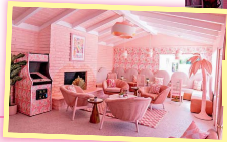
The Trixie Motel is like a Barbie Dreamhouse.

This picturesque area is sacred to the Cahuilla people who have thrived here for thousands of years. Rock art, house remnants, dams and trails still exist in the canyons. The scenery is like nothing I've ever seen before – a tropical paradise