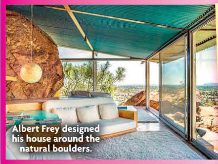
Albert Frey designed his house around the natural boulders.